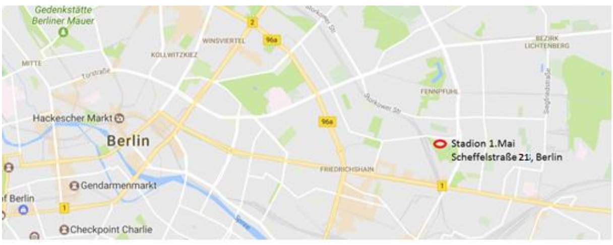
Abb. 2

The competitions will take place at "Stadion 1. Mai" in Berlin-Lichtenberg, Scheffelstr. 21, 10367 Berlin, Germany. There are changing and sanitary facilities as well as parking space.