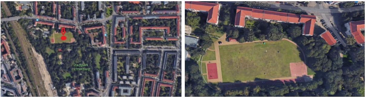
Abb. 3

Abb. 2